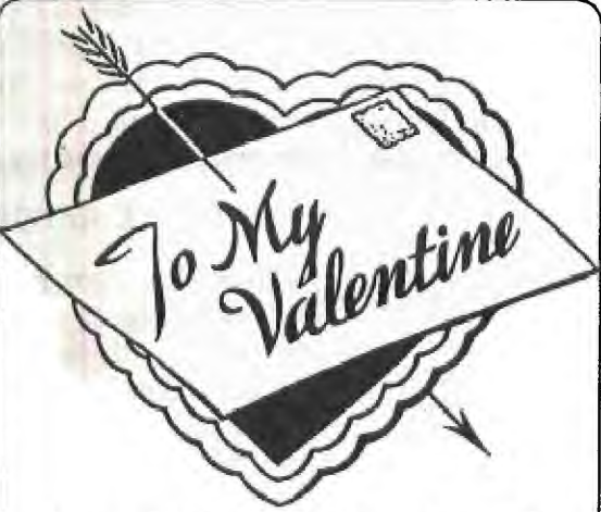
Happy Valentine's Day from the VAST Computer User Group