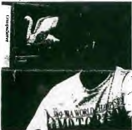
Dispenses expert TI advice: Beebe

The 99 was more than tough. It was an advanced machine for 1979: a 16-bit computer when Apple IIs and CP/M machines used 8-bit chips and long before the PC was a gleam in IBM's eye. Initially it was a modest machine with 16K RAM, 72K of ROM, a built-in operating system and a cartridge slot, but TI soon introduced an expansion box that gave the 99 a future. The box had eight slots and the capacity to control disk drives. Horn estimates that 80 expansion cards are now available and that users hook up everything from external hard disks to laser printers.