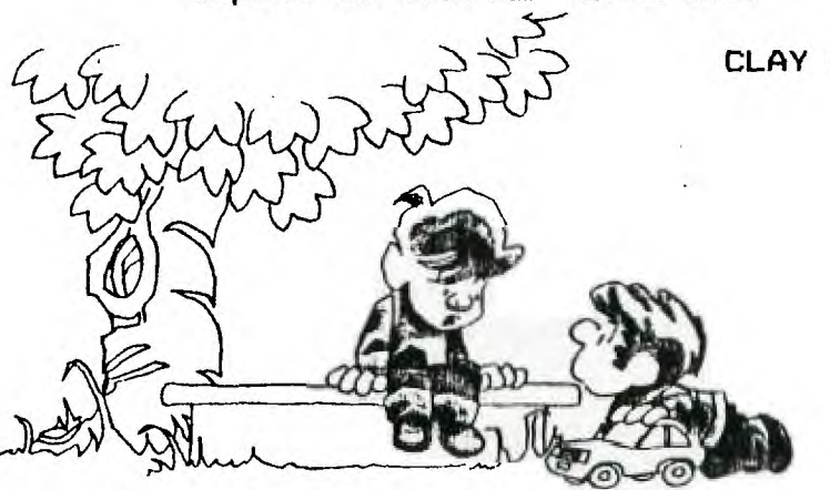
"The 'running away from home' ploy doesn't work anymore. They know I'd never leave my computer."

In the comming months I will try to tell you more of what is happening with the library, new programs and other topics of similar interest.